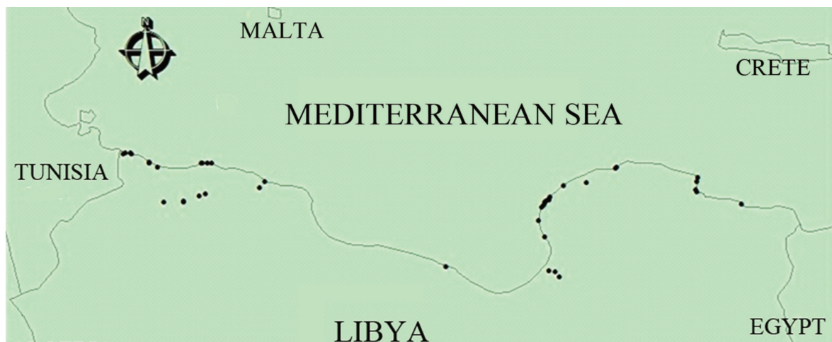
Figure 1. Sites included in the winter census in January 2012.

The overall number of species and individuals of waterbirds and non-waterbirds was lower than