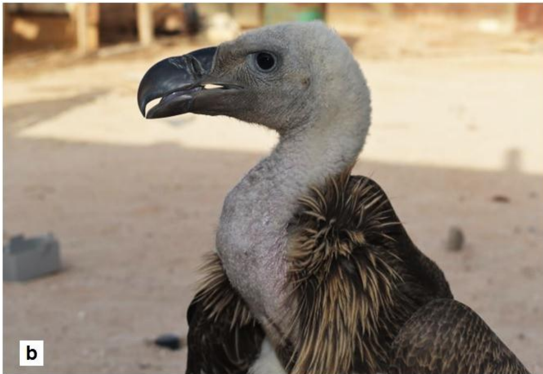
Fig. 2:( a). Rüppell's vulture in front yard of a house. (b). The bird is a sub-adult with beak and black eyes